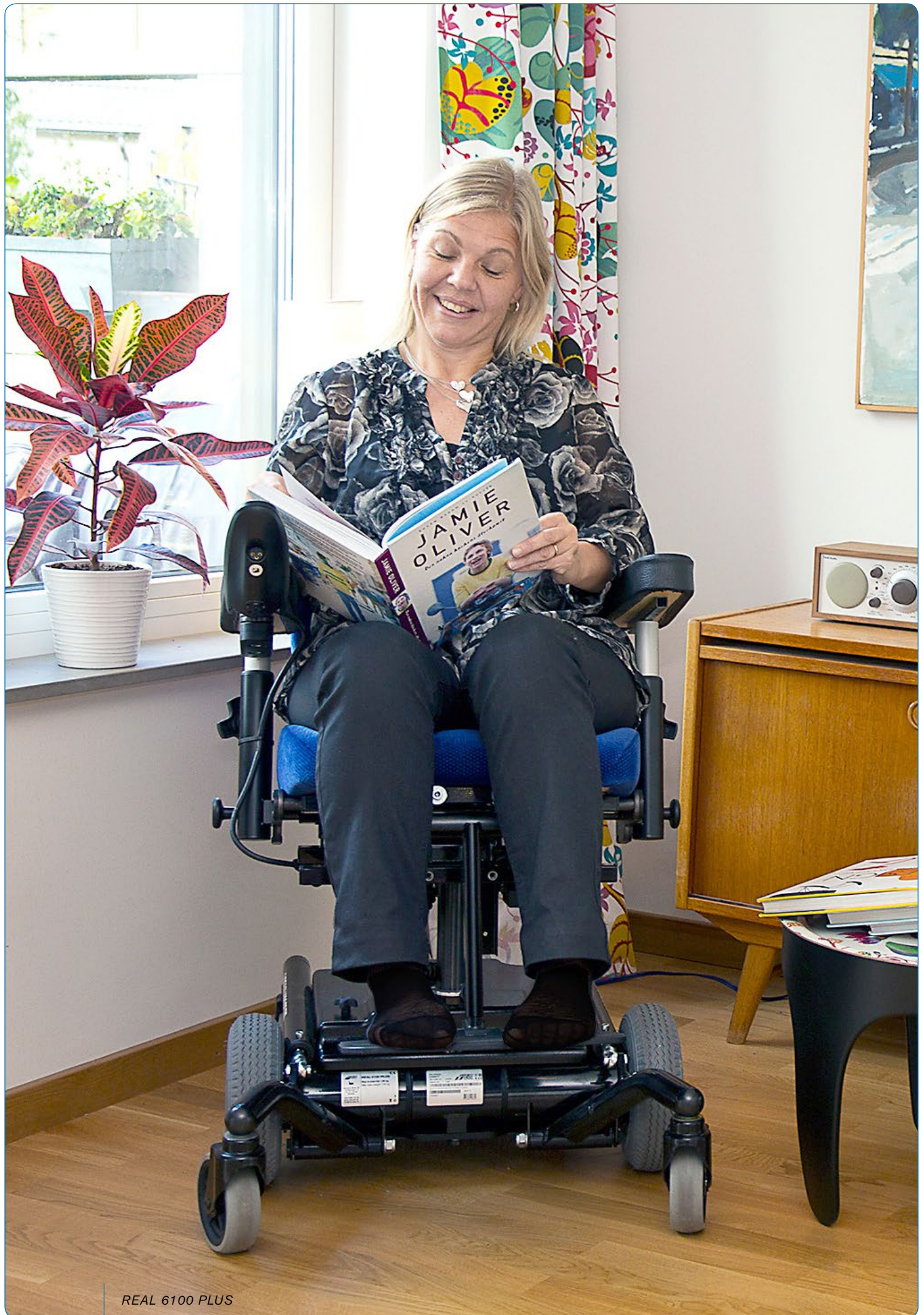
REAL 6100 PLUS